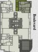
KEY PLAN (COURT YARD)